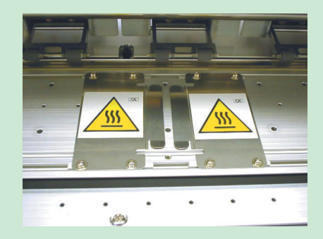
Metal paper guide